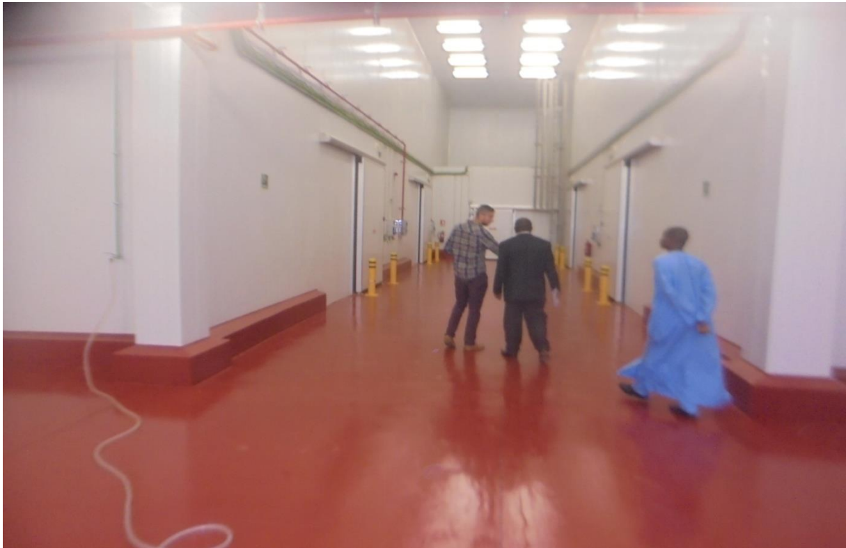
Inside view of the 6000 m 3 refrigerated warehouse in Yaounde