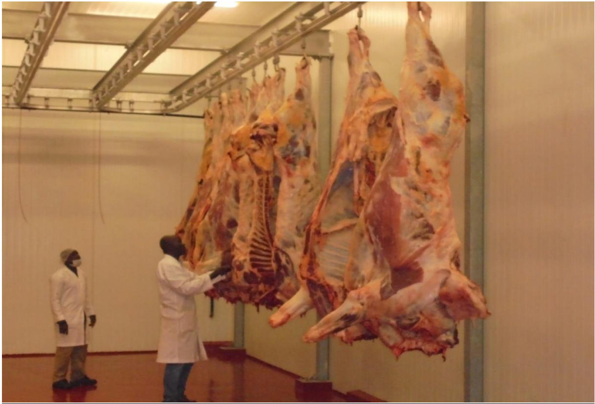
Bleeding area of the 250-per-day slaughter line in Ngaoundere