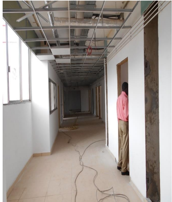
Works being completed at the Paediatrics Service