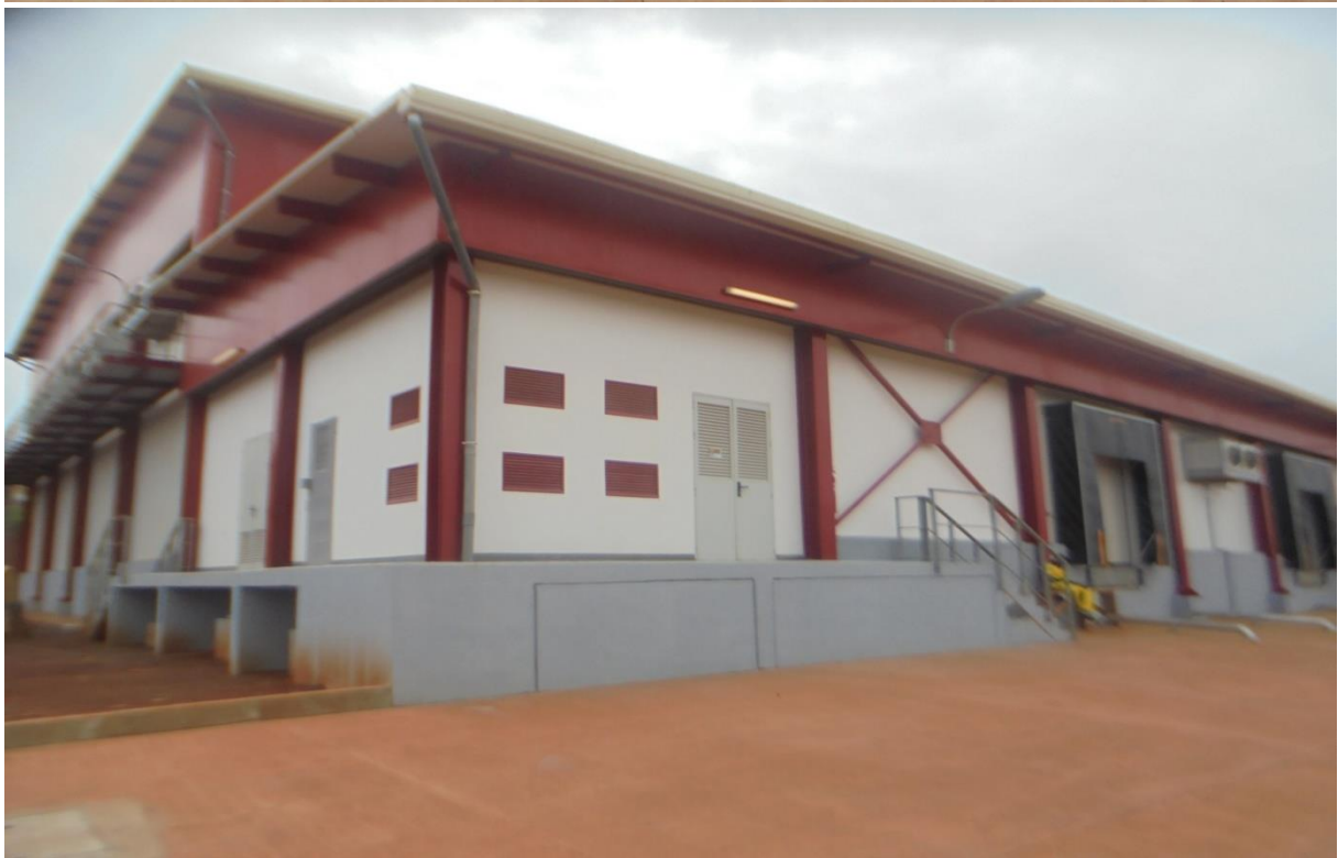
Front view of the 6000 m 3 refrigerated warehouse in Yaounde