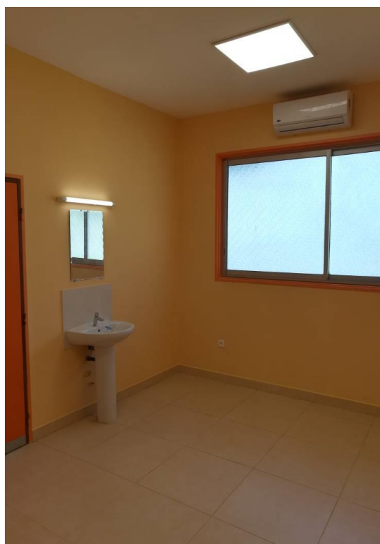
Outpatient Medical Consultation Service handed over to HGD on 11 December 2017