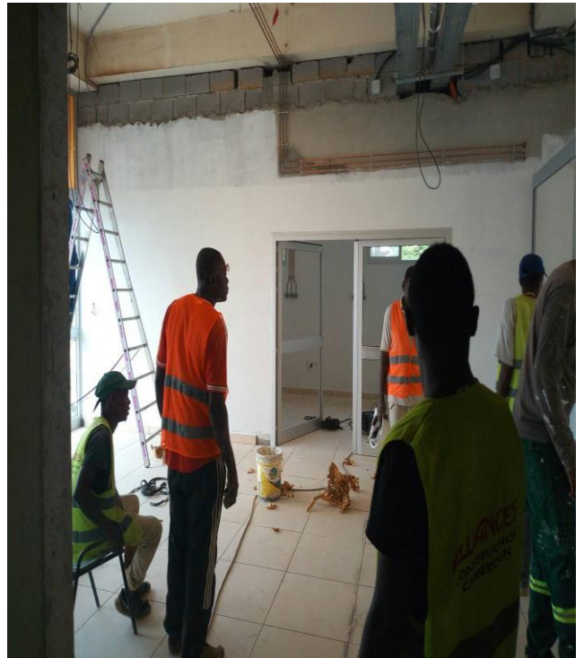
Works in progress at the Intensive Care Unit