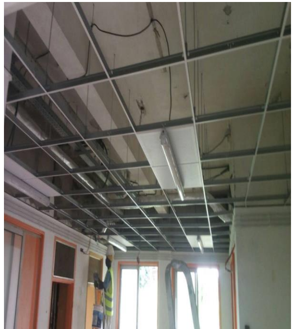
Some images of the ongoing works at HGD