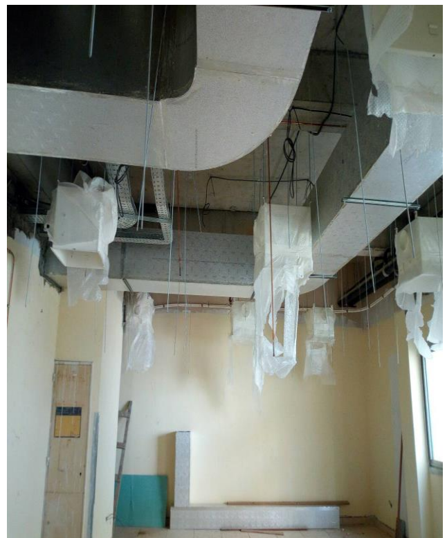
Works in progress at the Sterilisation Block