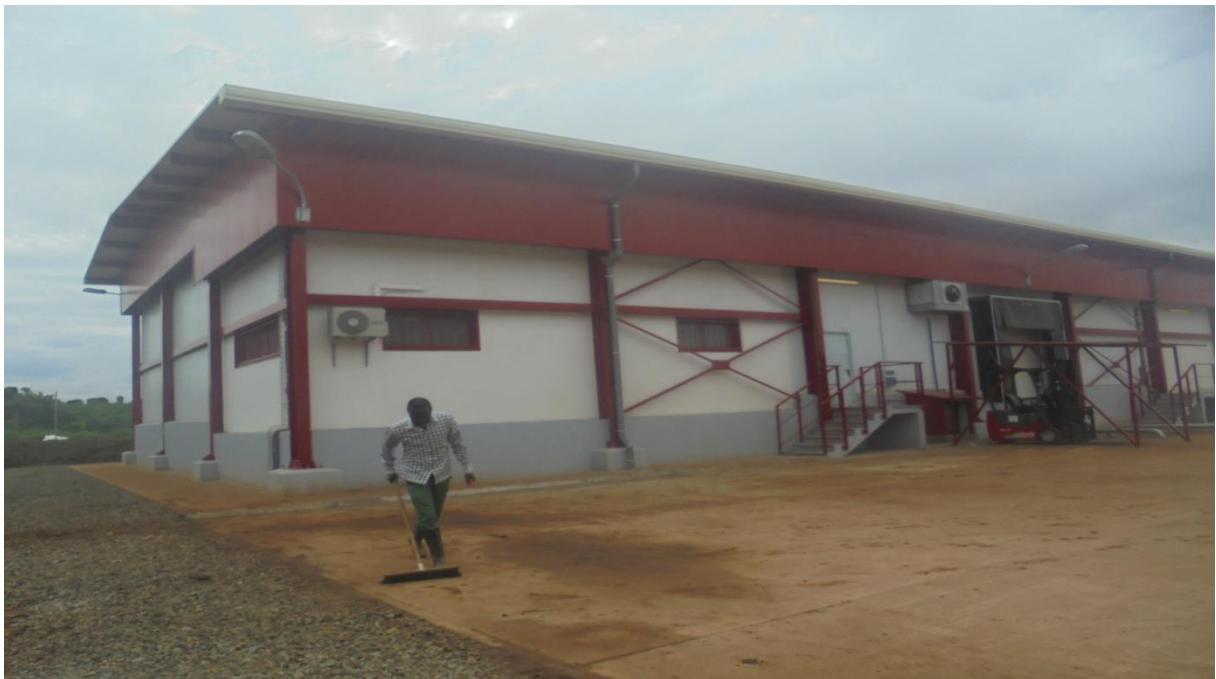
Outside view of the 1400 m 3 refrigerated warehouse in Ngaoundere