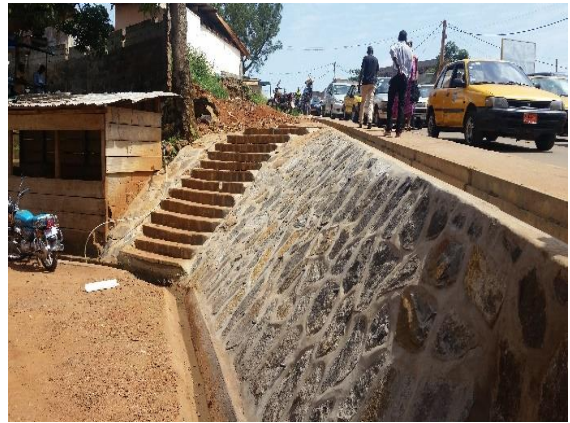
Rehabilitated resident accessways in the Mvog Atangana Mballa area