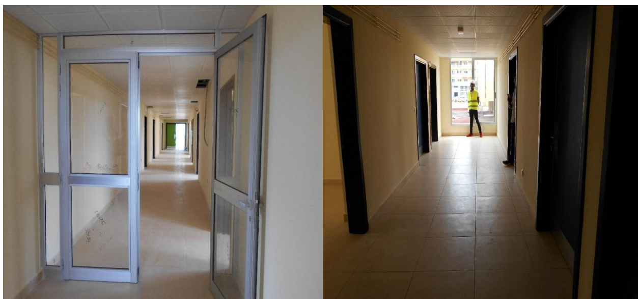
Gastro-enterology Service handed over to HGY on 7 September 2017

The latest developments in this file were an agreement reached between the MINSANTE and the company ALLIANCES, for the supply of equipment in accordance with the available amount. The related draft contracts will be submitted to the dedicated Commission before the end of this year.