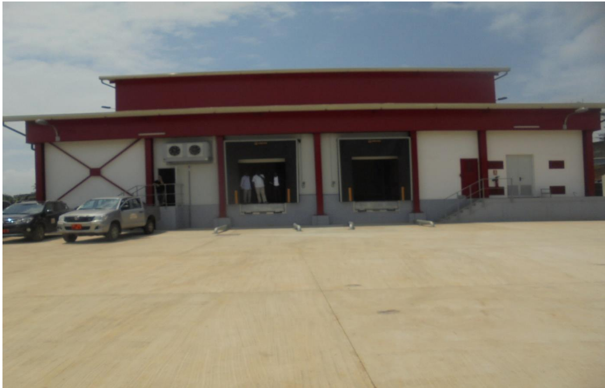
Main view of the 3000 m 3 refrigerated warehouse in Kribi