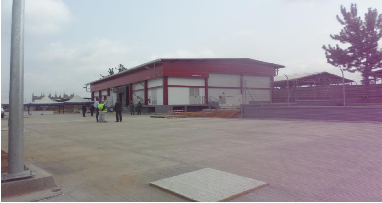
Outside view of the 1400 m 3 refrigerated warehouse in Ebolowa