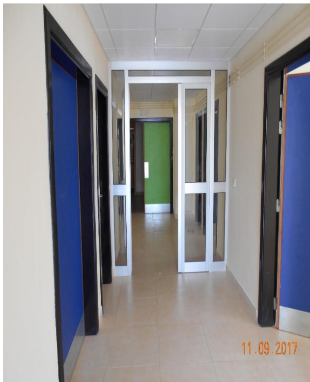
Works in progress at the VIP Block