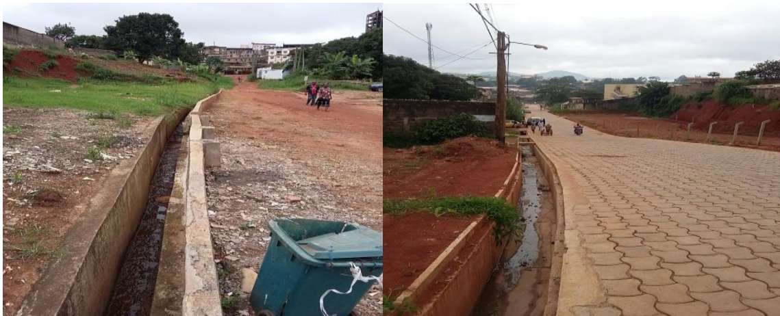
Rehabilitation of the PK 0+550 T1- T3 Intersection stretch