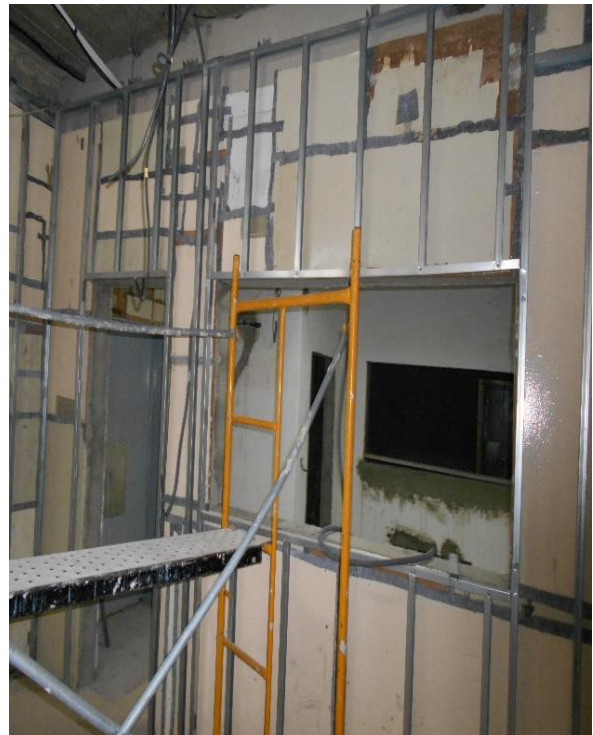
Works being completed at the Radiology Service