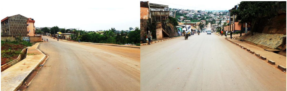
Rehabilitation of the accessway to the International War College in Simbock