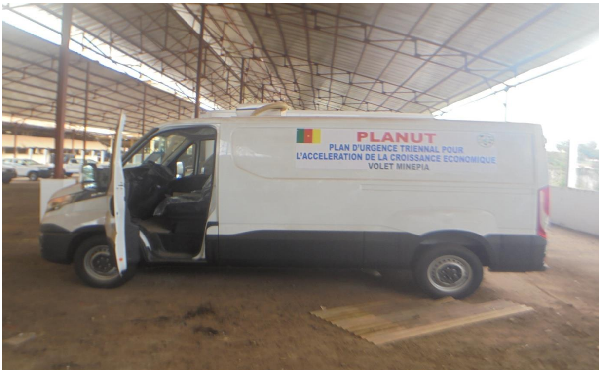
6 m 3 refrigerated vehicle