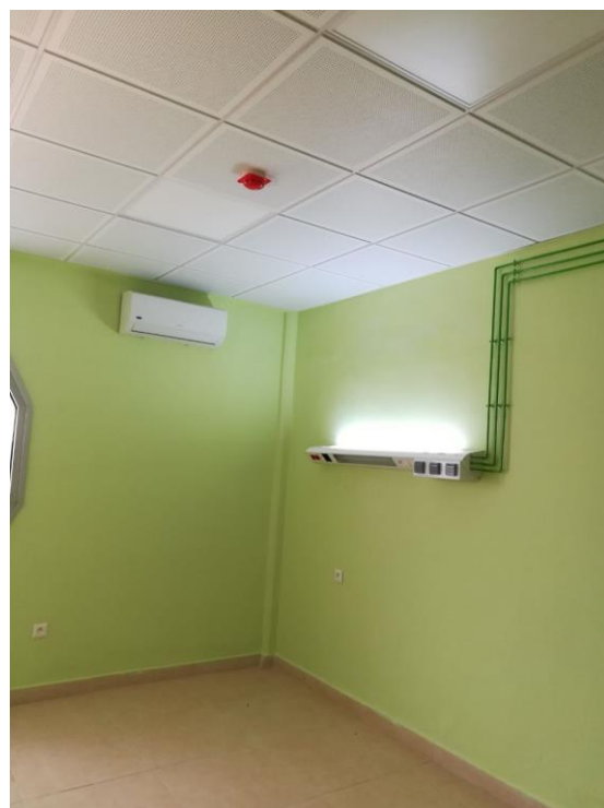
Outpatient Surgery Consultation Service handed over to HGD on 11 December 2017