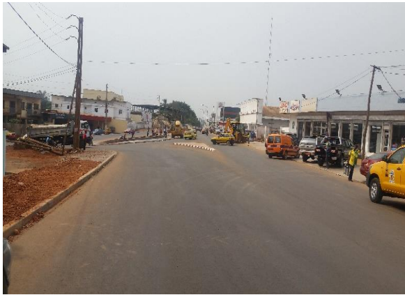
Rehabilitated road in the Mvog-Mbi neighbourhood