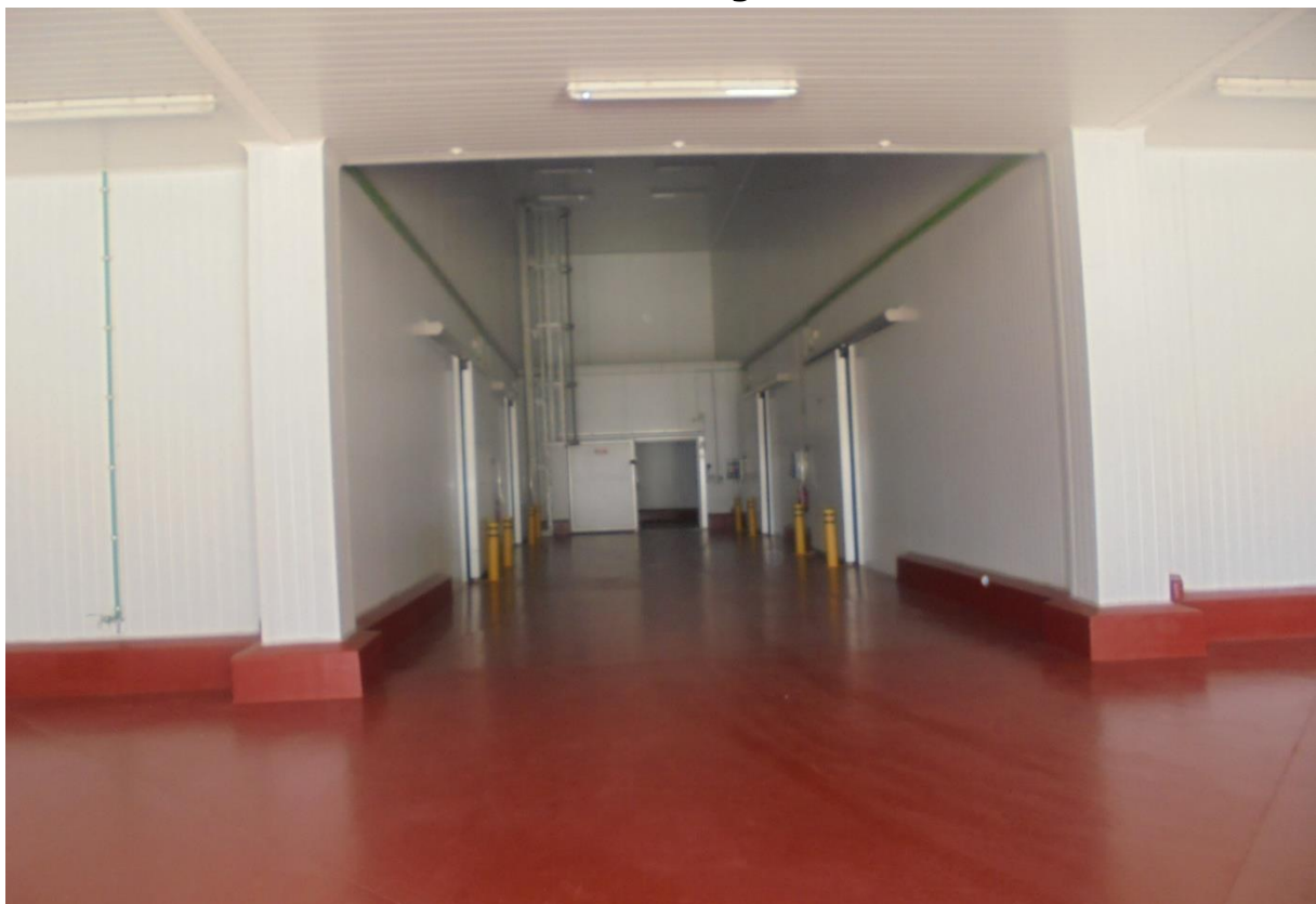
Inside view of the 3000 m 3 refrigerated warehouse in Kribi