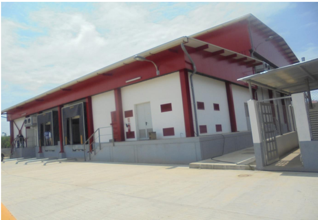
Outside view of the 3000 m 3 refrigerated warehouse in Kribi