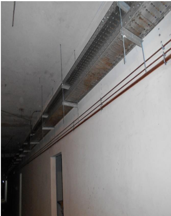
Ongoing works at the Basement