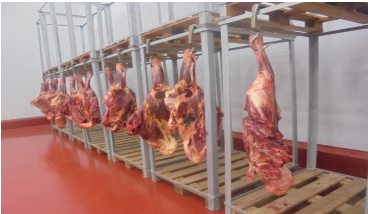
Storage of carcasses in the 6000 m 3 refrigerated warehouse in Yaounde