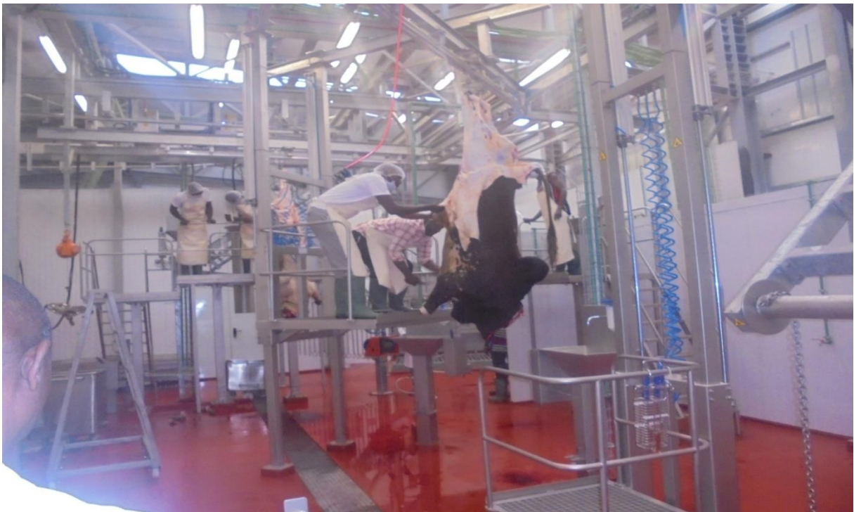
250-per-day slaughter line in Ngaoundere