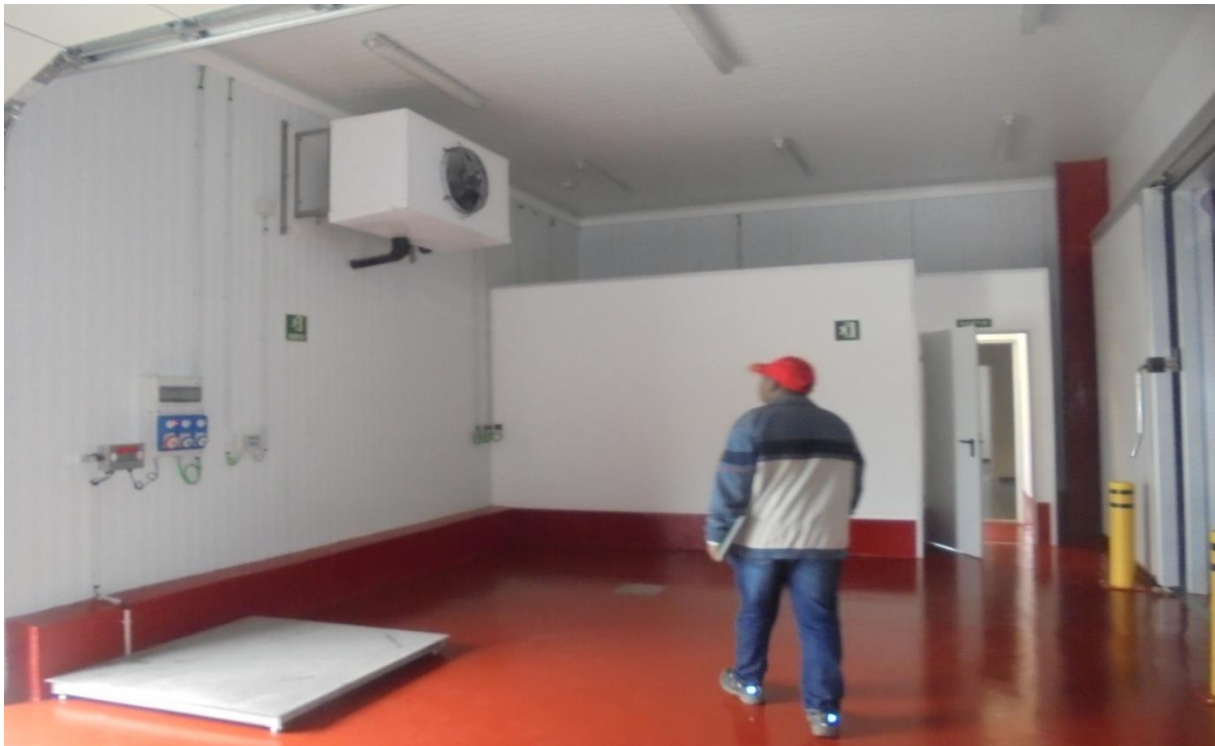
Inside view of the 1400 m 3 refrigerated warehouse in Ebolowa