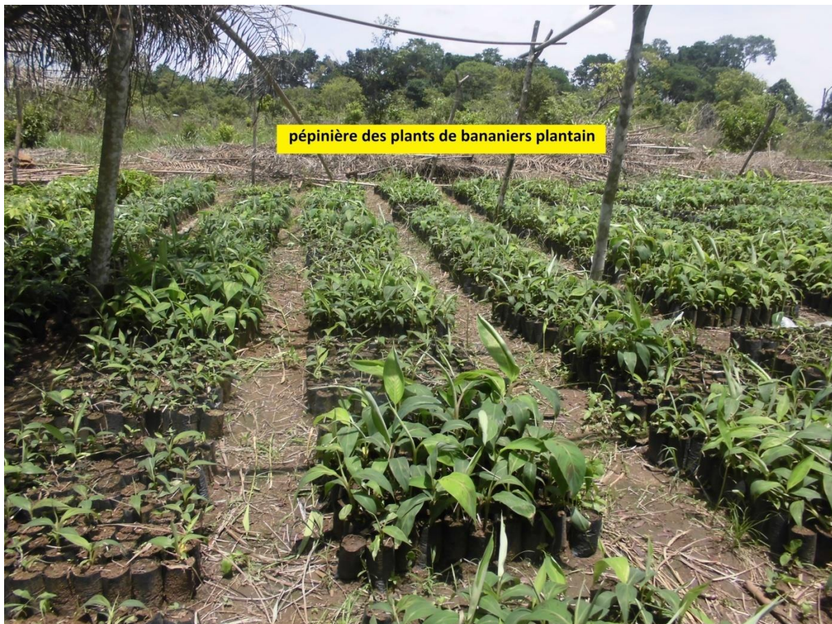
pépinière des plants de bananiers plantain