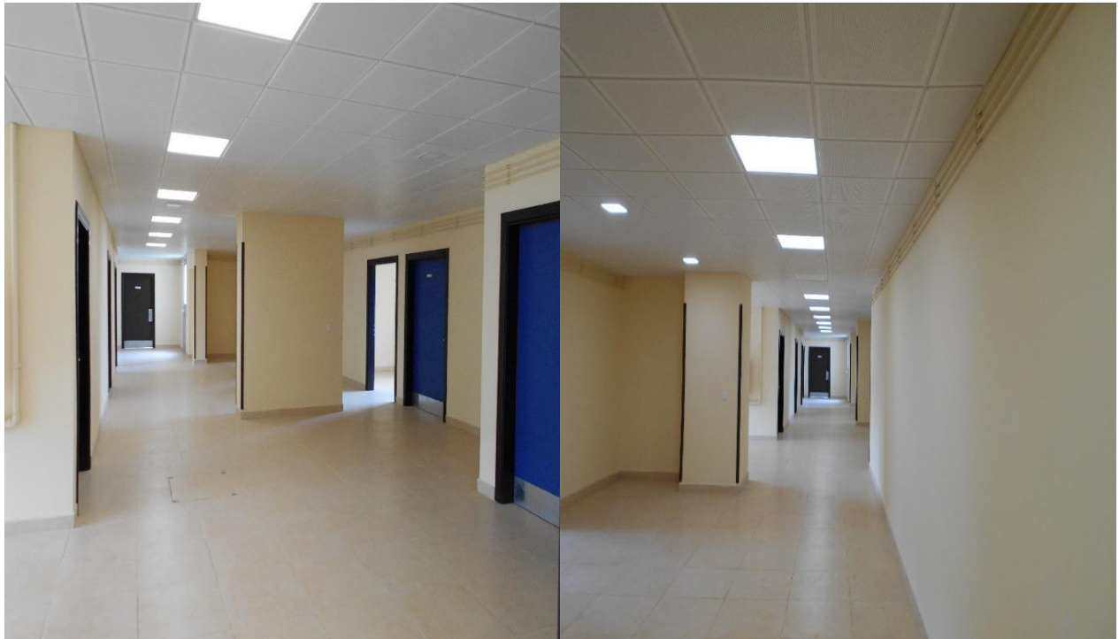
Outpatient Consultation Service handed over to HGY on 7 September 2017