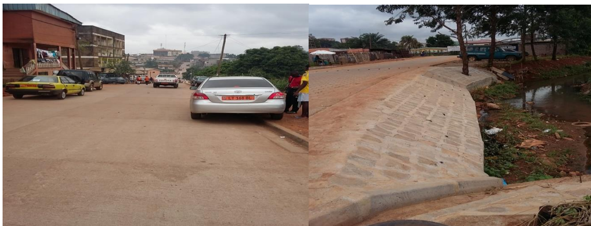
Rehabilitation of the HYSACAM road stretch