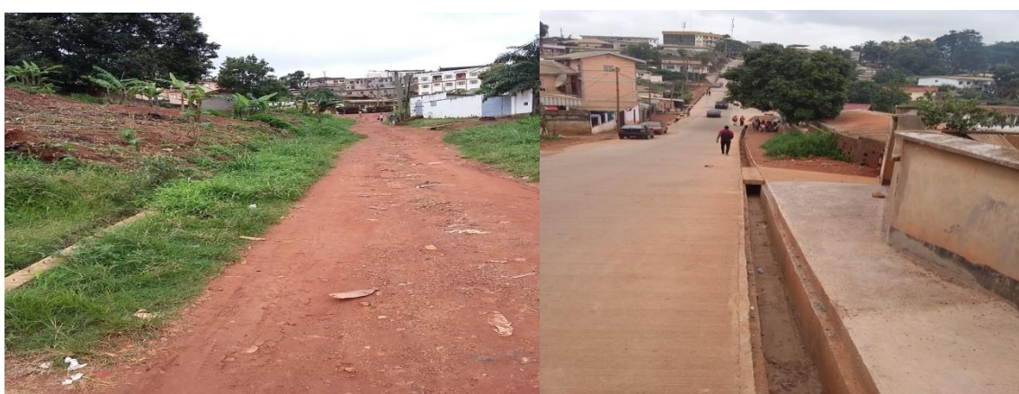
Rehabilitation of roads in the Mvog-Ada neighbourhood

In Douala, the works were carried out in the following neighbourhoods: Youpwé, Sodiko, Bonabéri, Bépanda, Camp Yabassi and Mbangué.