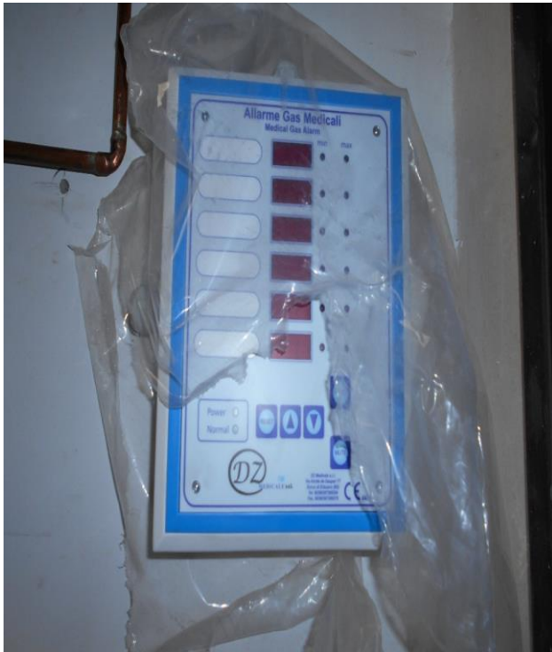
Medical gas supply system in the Operating Room