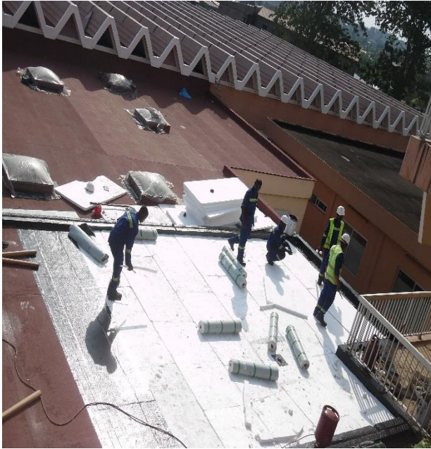
Some images of the ongoing works at HGD