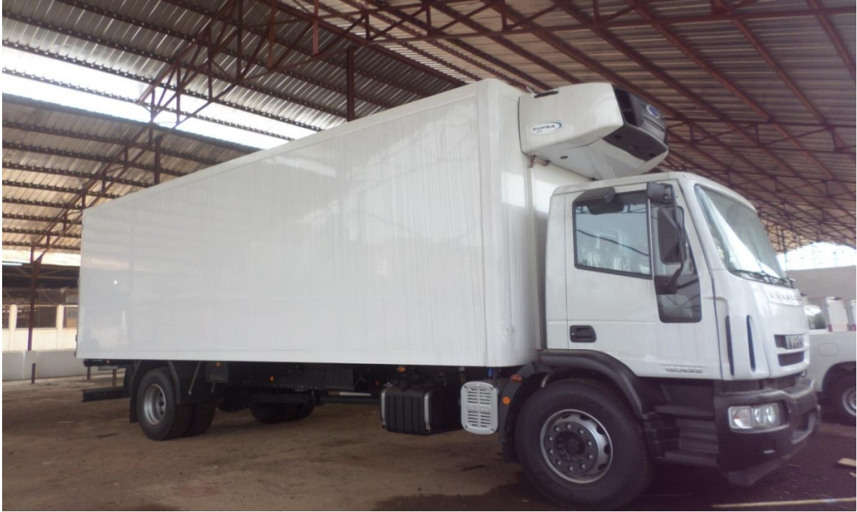
48 m 3 refrigerated lorry