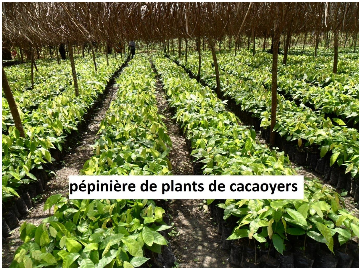
pépinière de plants de cacaoyers